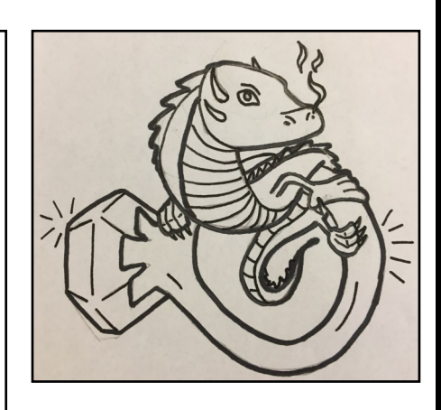
A Copperback claims it's jewellery.

They are extremely territorial and are often seen biting each other whilst fighting over sparkly things. Even larger dragons have been known to abandon their treasure if Copperbacks invade because they are very loud when