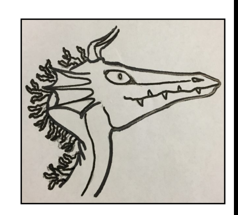
A female Timberhook displays it's twiggy crest.

Males usually remain a dull brown colour their whole life, but females flush a vivid red if their young are in danger.