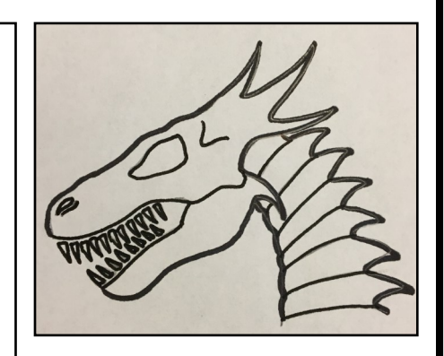
A Common Flintmaster

They have rarely been observed in their complete forms and sleep for long periods, usually close to treasure. Experts think many are now hiding in museums pretending to be dinosaur bones!